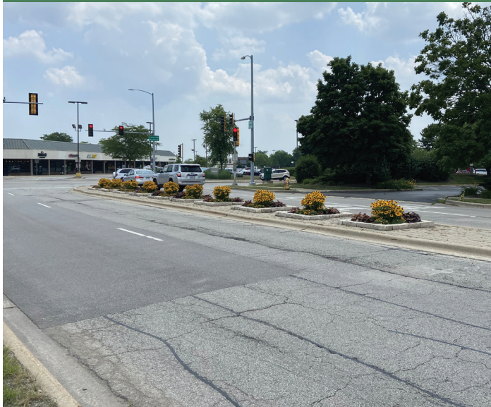
Dedicated left turn lane will be added to eastbound Hawthorn

3:00 p.m.–7:00 p.m. Sullivan Center 635 N Aspen Drive