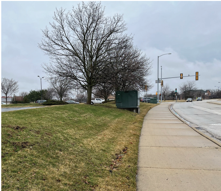
Bike path reconstruction along Lakeview